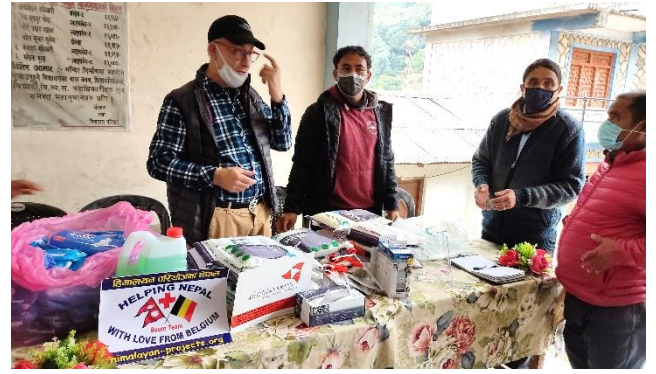
Explanation of correct use of prevention material