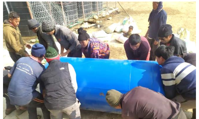
A water filter for safe drinking water for 7 villages.

Finally, a humble request to give us an extra push. Our work in the Himalayas is not finished, the needs remain higher than ever thanks to Covid.