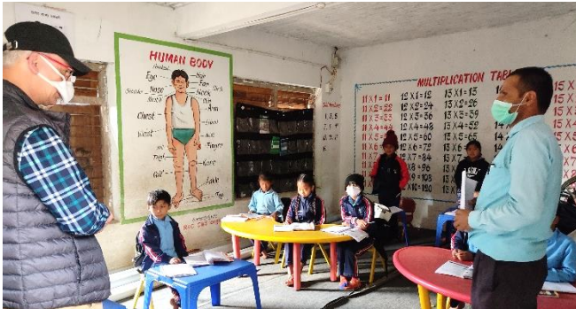
Classes getting an encouraging conversation.