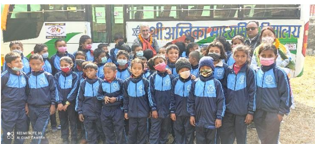
A bus for safe travel to and from their school.