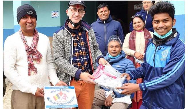
Hundreds of children get a proper uniform.