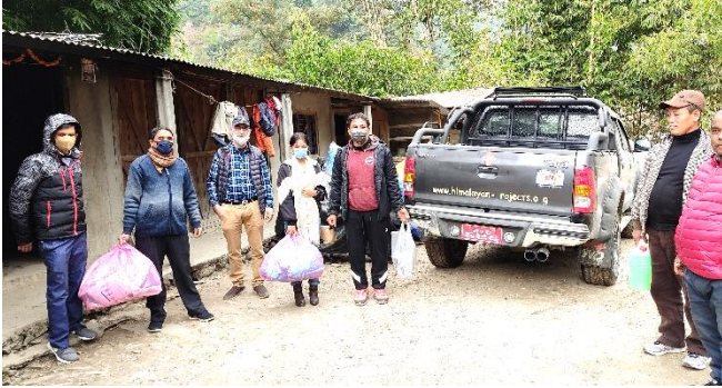
Masks, thermometers, visors, disinfection products for dozens of schools.