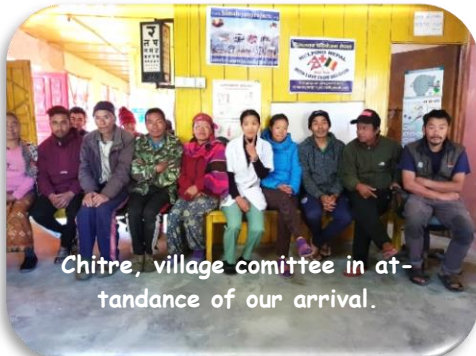
Chitre, village committee in attendance of our arrival.