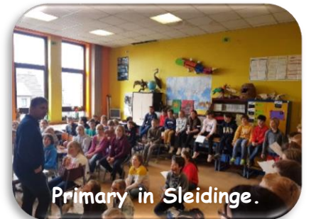
Primary in Sleidinge.