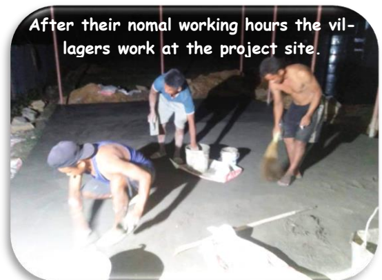
After their normal working hours the villagers work at the project site.