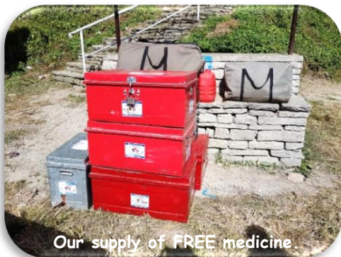
Our supply of FREE medicine

It turns out that we urgently need a solid mobile ultrasound and ECG device to better assess the patients.