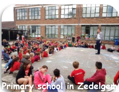
Primary school in Zedelgem

This year we were also a guest at the Sint-Rembertschool in Torhout, the primary schools GBS De Mosaïek in Roosbeek-Boutersem, the VBS De Leeuw in Zedelgem and the GBS in Sleidinge and in Sint-Michiels. Because awareness is also important here in the country. Interested parties: visit our site via this link: http://himalayanprojects.brugseverenigenen.be/ActiesinBelgi/Educatiefenactiematerial for a complete overview of our offers.