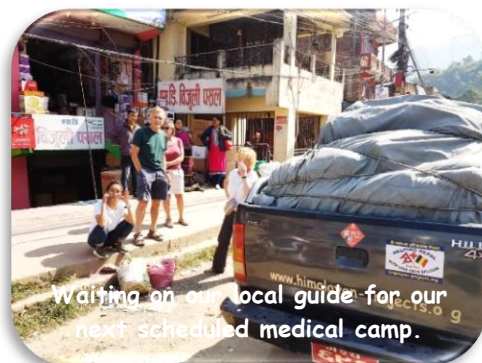
Waiting on our local guide for our next scheduled medical camp.