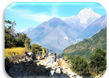
Near Chitre, our medical post: no matter how beautiful the landscape is, you literally have to drive over the roadworks.