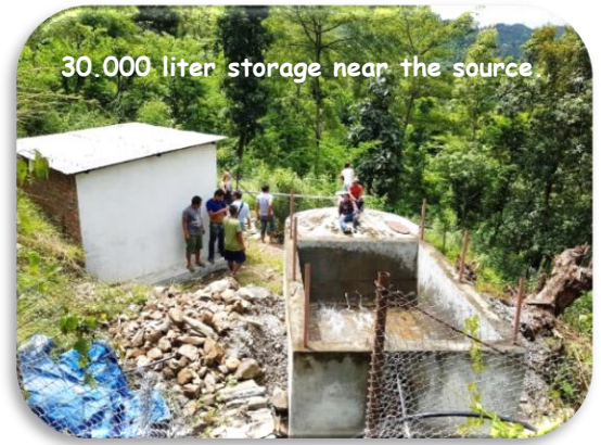
30.000 liter storage near the source.

Meanwhile, 4 years after the devastating earthquake and where the entire village was almost flattened, the village is busy rebuilding their houses. With an allowance from the government for a meager € 2,400.00 (!?). And therefore mainly with remittances from family members working abroad, contemporary houses sprout everywhere in the village. Small because of the money and the government inspector who imposed a lot of building restrictions in exchange for the subsidy. It takes some getting used to the modern - rather boring - building style, which completely removes the 'Bokrijk' feeling that these old villages had. Fortunately, they decorate the facades with bright colors. Also positive is that they provide a final or better sanitary indoors and also in the kitchen a gas stove with smoke extraction, which significantly improves the quality of life.