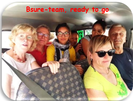
Bsure-team, ready to go