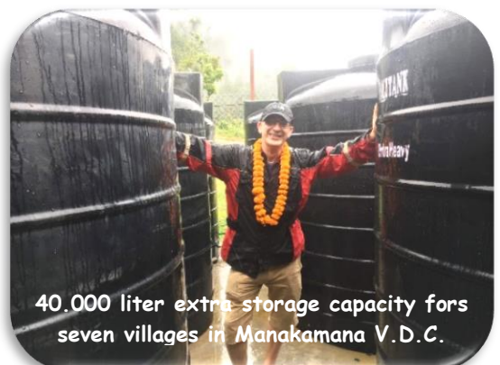
40.000 liter extra storage capacity for seven villages in Manakamana V.D.C.