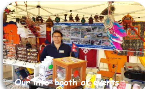
Our info-booth at events