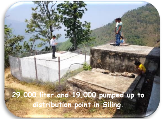
29.000 liter and 19.000 pumped up to distribution point in Siling.