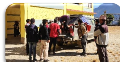
Shree Jayanti Sec. School.