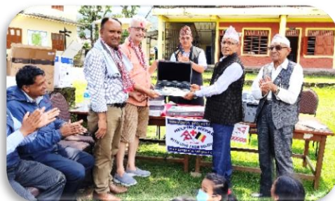
Gauri Shankar Sec. School.