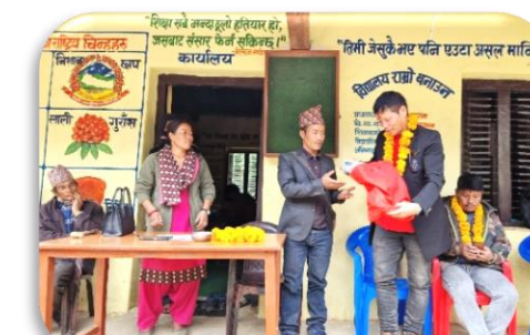
Shree Saraswati Sec. School.