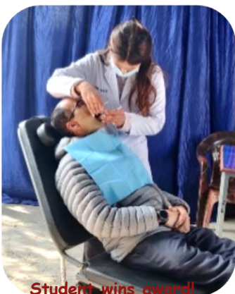
Student wins award!